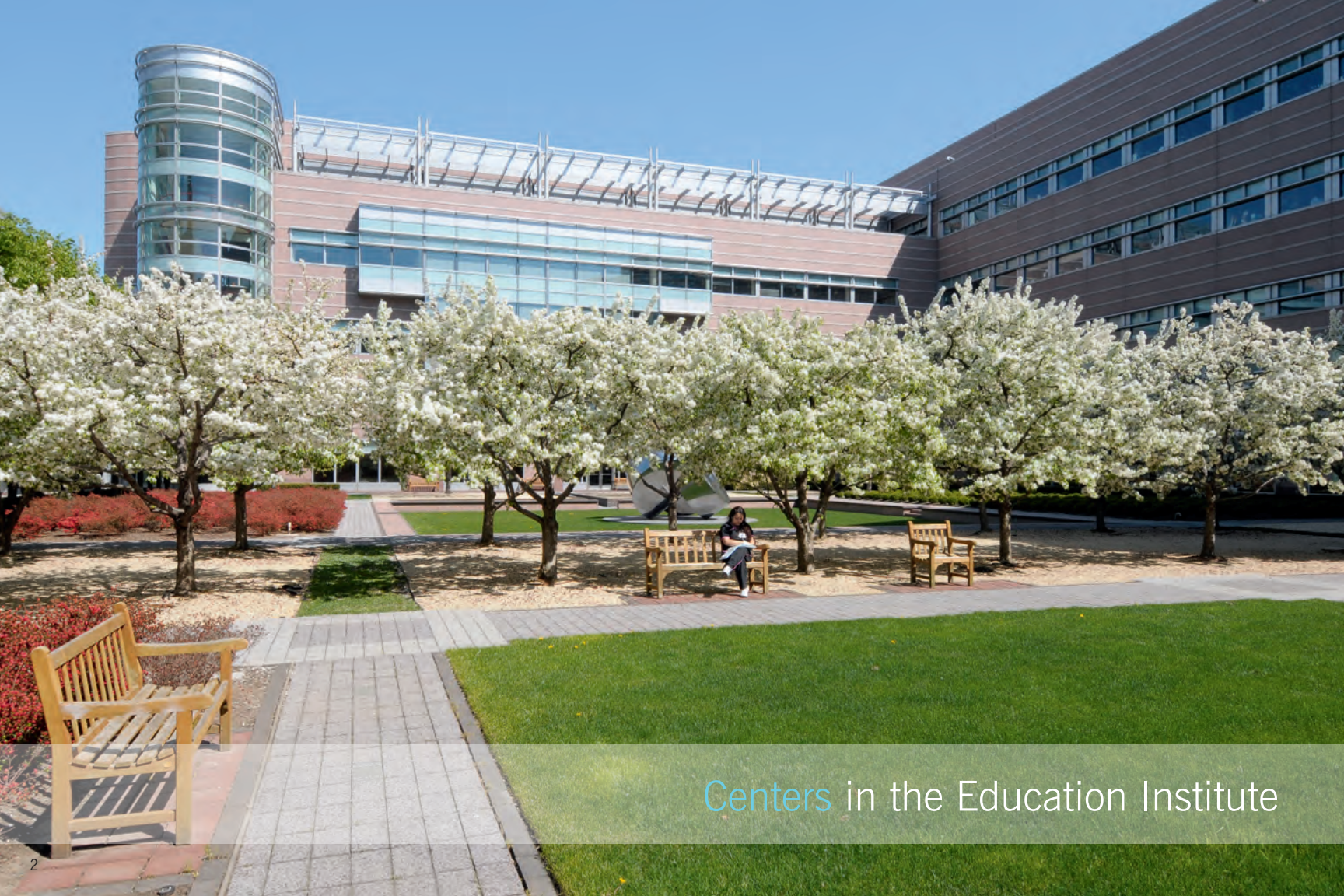
Centers in the Education Institute