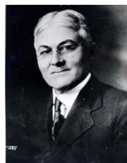
George W. Crile Sr., MD

To learn more about its history and centennial celebration planned this year, visit clevelandclinic.org .