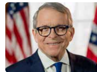
MIKE DEWINE Governor