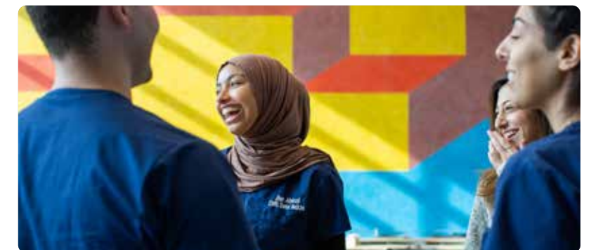
NOTE: All images were taken in 2019, before the COVID-19 pandemic.